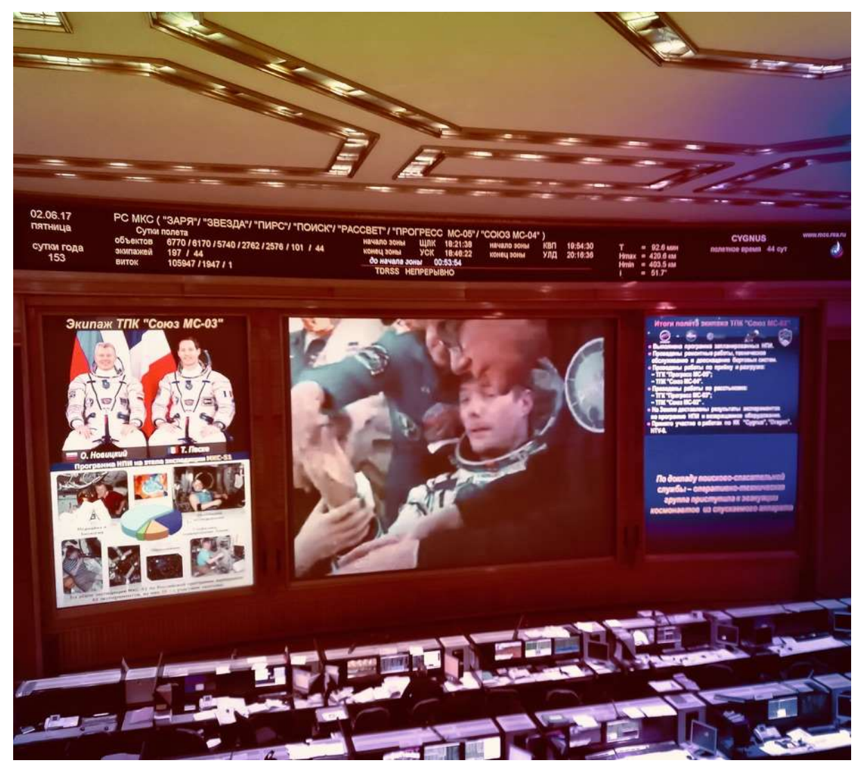
Photo 5. Control room of the Russian space control centre in Korolev. Picture taken from the upstairs ledge in June 2016.

Either in developing a critical look at what I would see around me or in reflecting on how I would interpret certain situations, this event led me to be extremely self-aware of how much drawing fast and superficial conclusions in the field can be easy—and tempting. This photograph still reminds me of this lesson.