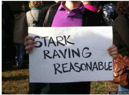
Figure 9: Extreme reasonableness at the Stewart/Colbert rally.

The deliberate good nature of the crowd and the counter-narrative of Colbert's "keep fear alive" theme allowed Stewart to navigate a very treacherous position. He was teetering on the brink of sincerity and seriousness, a dangerous precipice indeed. When the jesters stop laughing we know we're in trouble. Although Stewart's closing remarks, focusing on the cooperative spirit and productivity of the average American were quite eloquent, he walked a fine line. Still, he brought, in textbook form, the comic corrective to the tragic narrative of polarization that dominated the conversation.