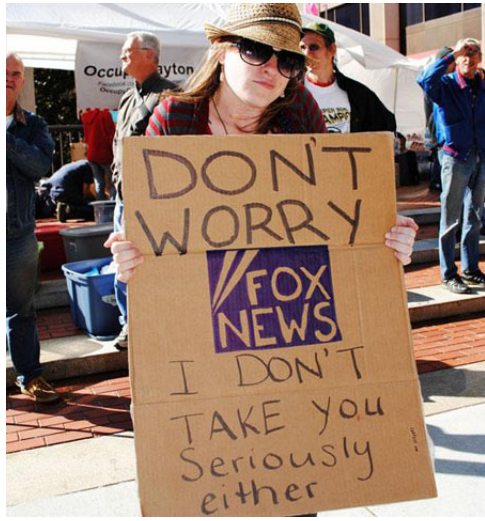
Figure 2. An Occupy protestor responds to Fox News coverage of the movement.