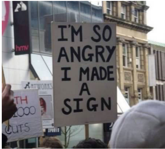
Figure 6: It may not be the top of the scale of political participation, but it's up there.

The upward or lateral target is the hallmark of the jester. Although this role has origins in the days of monarchy, the term remains appropriate. In a monarchy, the jester was the only one allowed to criticize the most powerful, with the understanding that ultimately the jester himself would “play the fool.” In this way the jester protected the status quo, while providing an outlet for the political frustration of the subjects. In a democracy, the status quo is the ongoing competition. In laughing at our political opponents, we keep our conflict grounded. We don’t laugh at evil. We laugh at stupidity. It is less threatening, and leaves hope that someday we will convince them to wise up and join our side.