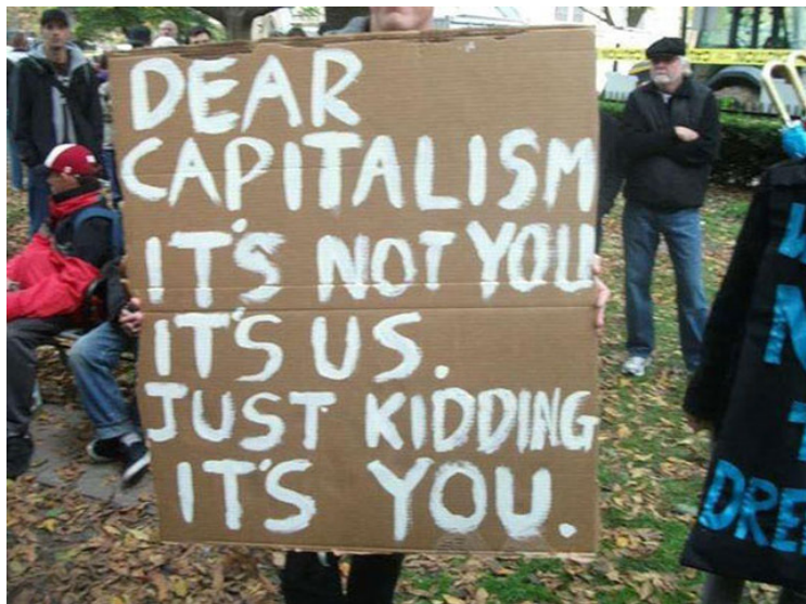
Figure 14: The love affair is over, and all I got was this classic breakup line.

The occupiers built networks and broadcast their protests live on the Internet from laptops. They used social media to organize demonstrations, spread information about law enforcement activities, and garner support among the rest of the population. As police in several cities used tear gas, pepper spray and other methods to control the protests, the movement generated images that became Internet memes. Moreover, they engaged in tactics of “creative disruption,” such as halting home foreclosure auctions by singing, and camping on the lawns of homes targeted for foreclosure. 26