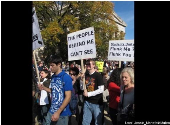
Figure 10: A Comedy Central rally participant being informative.

Perhaps it is not within the role of the satirist to mobilize people to rally for civility, but it is well within the role of the jester. Just as in the monarchy, where the jester’s ultimate loyalty was with the royals he served, in a democracy the jester’s loyalty is to the ideal set forth in the Bill of Rights: “all men are created equal.” It is the measuring stick he uses to calculate and report the gap between our stated goals and where we are in the moment. Ultimately, while the rally may not be remembered for the brilliance and bravery of the critique, it did inspire a large demonstration in support of democratic cleverness, a cleverness that was shared and celebrated by other citizens through television rebroadcasts and Internet posts. 22