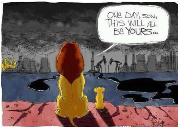
Figure 4: "Political Memes Today," accessed March 3, 2015 at: https://politicalmemestoday.wordpress.com/tag/lion-king/

In order to do this he changes his clothes so that he looks like a beggar, explaining that impersonating a citizen of lower status will only emphasize the cleverness of his argument. He makes his case with great rhetorical skill, inspiring his listeners with his wit and oratorical prowess, and is rewarded by being elected to power. Once he has secured this power, he proceeds to become what he previously derided, pursuing politics as if it were only a game, falling in love with the sound of his own voice, and losing touch with his constituents. In this way he completes the democratic cycle of illusionment-disillusionment. Such is the circle of political life.