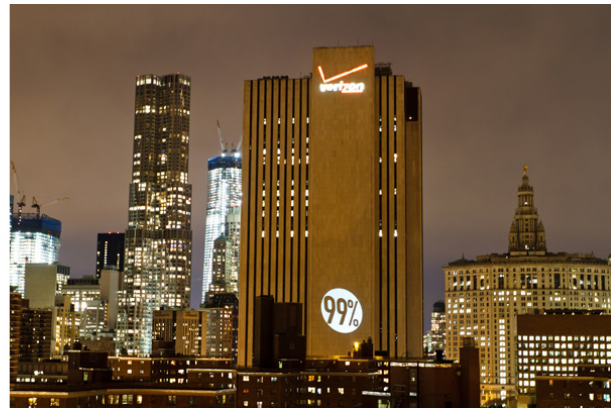
Figure 16: The Occupy ‘bat signal.’

After a particularly brutal response by campus police to protestors at UC Davis, the students confounded expectations by staging a highly effective “silent” protest of the chancellor at a moment when all expected to hear angry, shouting voices. Video of the chancellor’s “walk of shame” quickly went viral on the Internet. 30 Even more viral was an image of a campus police officer casually pepper-spraying peaceful students. This image was quickly turned into an Internet meme.