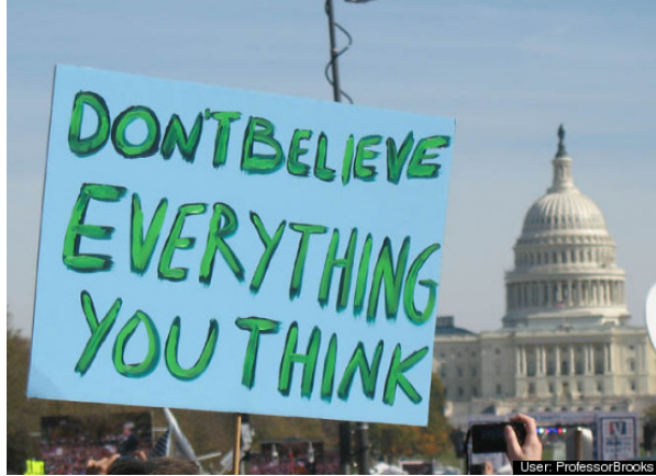
Figure 5: Advice to make you think.

In his choice of a citizen protagonist for the first comic play, Aristophanes establishes the first rule of democratic comedy: the inversion of power is a necessary element. The power of comedy is wielded awkwardly by the dictator, but is devastating in the hands of his oppressed subject. 8 This principle is the foundation for the taxonomy of Jester, Trickster and Bully. I propose these categories as tools for the analysis of power dynamics inherent in comic political messages. Case studies representing mass media (Jon Stewart and Stephen Colbert), User-Generated Content (YouTube video) and the Occupy Wall Street social movement will be used as examples for the categories. The taxonomy proposes that, consistent with Burke's identification of the tragic with the comic corrective as the proper "attitude toward history," 9 the comic narratives of jesters and tricksters are essential to democratic discourse, while bully humor requires a form of "othering" that celebrates and reinforces inequality. Tricksters...they are here to make us think, and to challenge our assumptions.