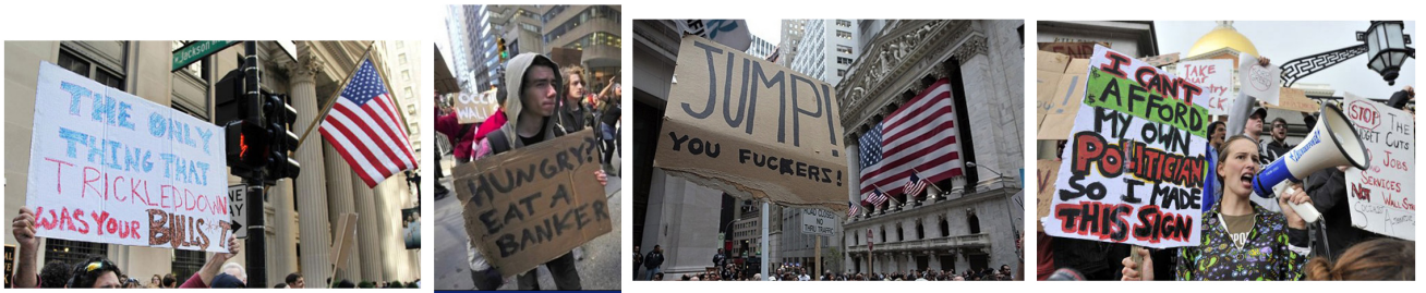
Figure 18: They know where the money went.

Ultimately, the occupiers were successful in creating and disseminating a collective narrative about the underlying causes of income inequality, and what they saw as the compromised and corrupted condition of our country's democratic process. The narrative created by the movement made space for a new iteration of the citizen-protagonist, demonstrating a way of "doing" dissent, marking what has played out as a slow but clear cultural shift away from the "greed is good" narratives of Wall Street philosophers. It is arguably the failure to recognize this shift that sabotaged the 2012 presidential campaign of Mitt Romney and Paul Ryan.