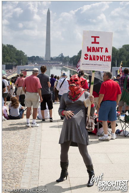
Figure 8: Although attendees were asked not to bring signs to the Glenn Beck rally, this demon felt her nutritional needs were more important.

Enter Jon Stewart and Stephen Colbert, hosts of Comedy Central’s late night comic news lineup. The Daily Show and The Colbert Report offer an hour of political satire and parody every weeknight. Their programs are popular—they are not only entertaining, but also informative. 16 Jon Stewart is perhaps the most prominent jester in contemporary U.S. culture, regularly mocking both media and political elites. For his part, Colbert built a successful show out of his parody of Fox news personalities such as Bill O’Reilly and Mr. Beck. It is hard to imagine these two comedians ignoring an opportunity to shoot a few comic arrows at the apocalyptic narratives being spun by the Tea Party.