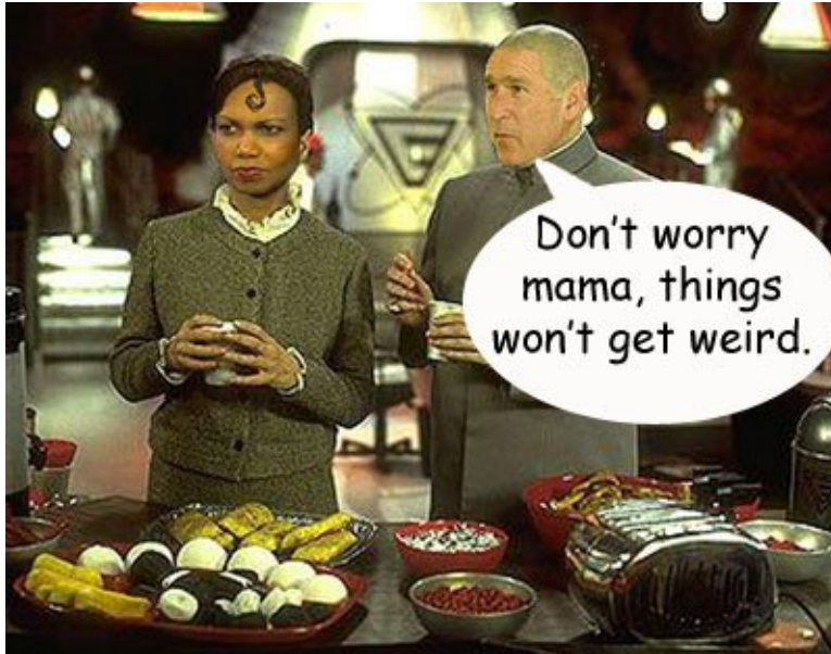
Figure 1: One of my Photoshop images, created at the beginning of the Iraq war, with George Bush as Dr. Evil. Frame from Austin Powers: International Man of Mystery (Pixar Studios, 1997).

a brief examination of political discussion on the Internet quickly reveals that comic messages are the coin of the cyber-realm. I was struck by the power of the well-timed, witty observation. My parody songs and Photoshop comics were not just satisfying because they gained a measure of approbation from my online cohort (although that was rewarding). The images, animations and songs were incredibly satisfying to create. It felt like participation, and it also felt like play. Adding my voice to other dissenters felt like a way of maintaining hope amidst disillusionment. And so my own participation gave birth to my interest in the central role that comedy plays in perpetuating democracy, and in creating the conditions under which a democratic system can be sustained.