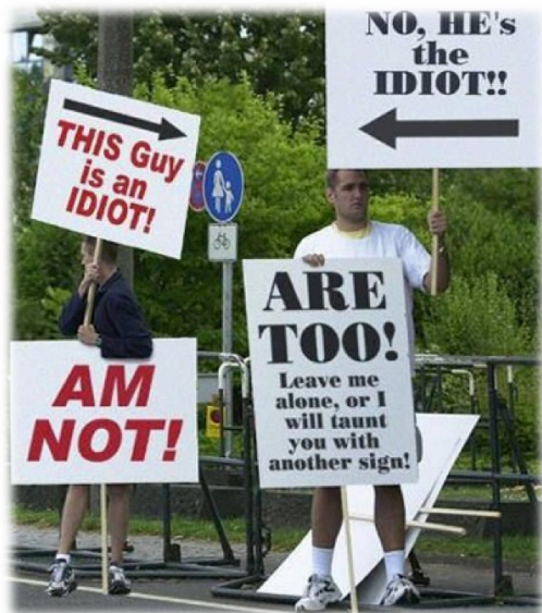
Figure 3: Not evil, just an idiot.

As Speir notes, “the diverting political joke not only influences the course of dispute, but also the desire for conflict among the participants. The joke changes them, so to speak, as it deemphasizes the conflict.” 6 With comedy, we are able to express our ambivalence and our hostility, point to incongruities and constantly invert, revealing and even celebrating the complexity that underlies human motivation. It is worth noting that Speir argues that the joke changes the people, and not the circumstances. However, one thing does have a way of leading to another. Comic narratives ultimately serve the purpose of converting ordinary citizens upwards into citizen-protagonists.