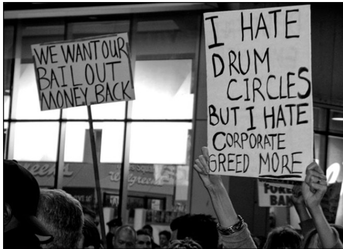
Figure 12: Kumbayah this sign.

Ignoring the obtuseness of media coverage, whether deliberate or inadvertent, the occupiers took a do-it-yourself approach to getting their message out that was in line with their other efforts. The movement did not put forth a leader, or seem concerned about elevating anyone to the position of “official” spokesperson, calling themselves the 99%. Nor would they identify themselves with a political party. They did not immediately present a list of demands, but also made no secret of their overall theme of inequality. They built a community in a public space, making themselves visible to the bankers on Wall Street and eventually the larger public. They marched. They set up community food distribution points, and set out to demonstrate their idea of what a more just society might look like. They held meetings and talked and made puppets and danced around drum circles.