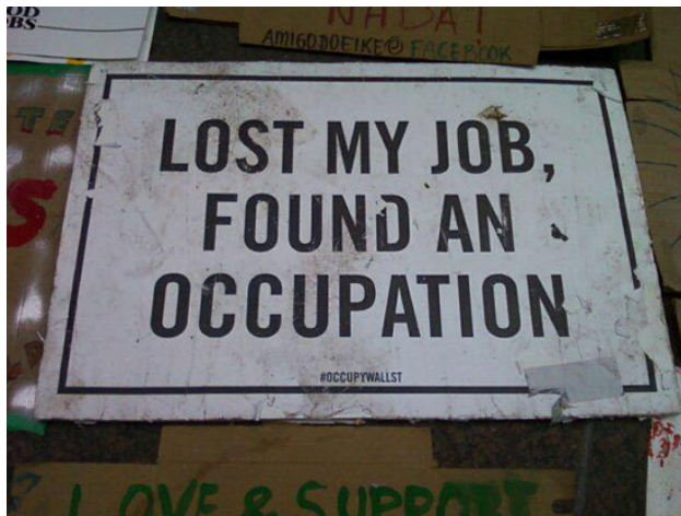
Figure 13: No caption necessary.