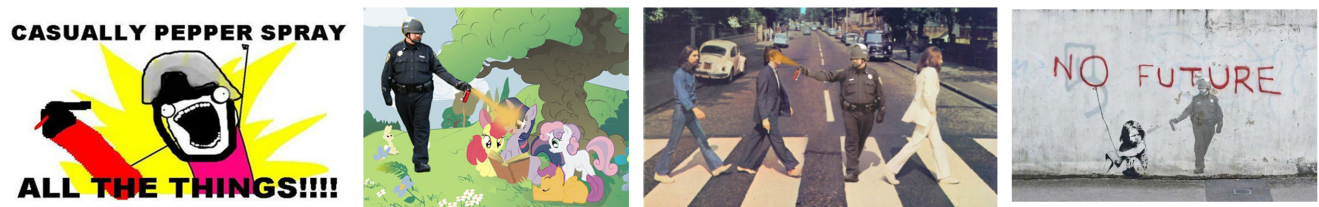
Figure 17: The meme came to be known as "casually pepper spray everything." More can be found at: http://www.occupythegame.com/lieutenant_john_pike/

Ultimately, the occupiers were successful in creating and disseminating a collective narrative about the underlying causes of income inequality, and what they saw as the compromised and corrupted condition of our country's democratic process. The narrative created by the movement made space for a new iteration of the citizen-protagonist, demonstrating a way of "doing" dissent, marking what has played out as a slow but clear cultural shift away from the "greed is good" narratives of Wall Street philosophers. It is arguably the failure to recognize this shift that sabotaged the 2012 presidential campaign of Mitt Romney and Paul Ryan.