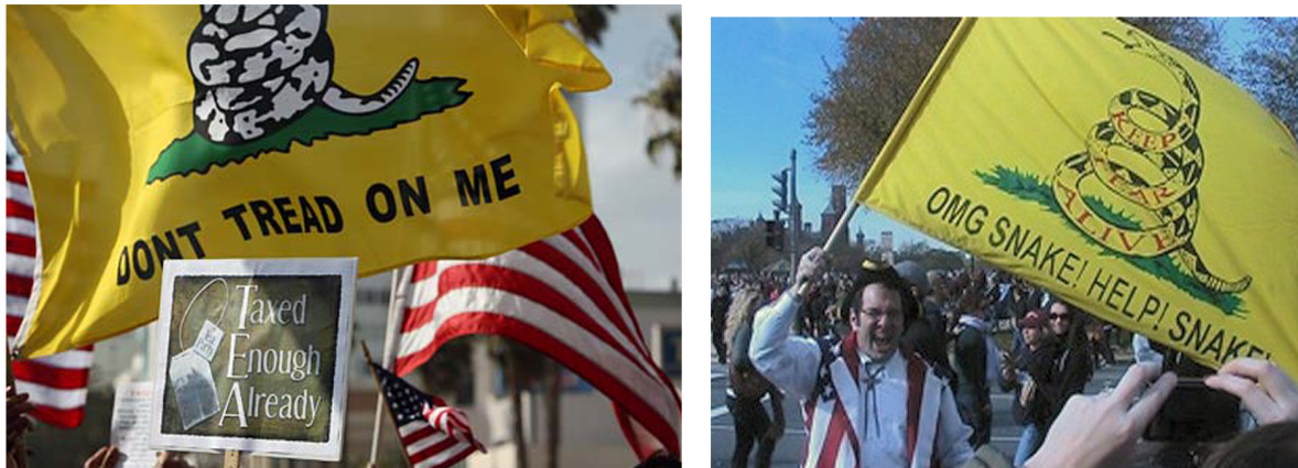
Figure 7 Two different takes on the snake, one from a Tea Party rally (l) and one from the Stewart/Colbert rally (r).

The 2010 midterm elections in the U.S. featured numerous rallies in Washington DC, most notably two that were organized by cable television personalities. On August 28, Glenn Beck, then a popular Fox News television host held a “Restoring Honor” rally on the steps of the Lincoln Memorial. The rally was widely discussed across media outlets, and viewed by some, especially participants, as evidence of an insurgent populist movement among conservative citizens in the U.S. Tens of thousands of attendees traveled to the site from across the country, many of them Christian-right members of the Tea Party Movement. 15 The event was designed to bring together conservatives who were clearly suffering the effects of democratic disillusionment after the election of Barack Obama as United States President.